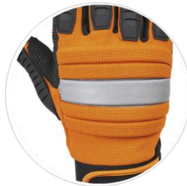
Special anti-impact reinforcement