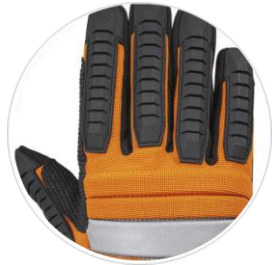
Finger back protection - TPR reinforcement