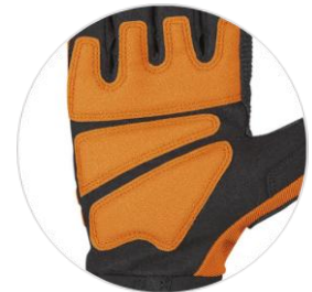
Palm protection – durable PVC reinforcement with anti-vibration foam padding and strong double stitching